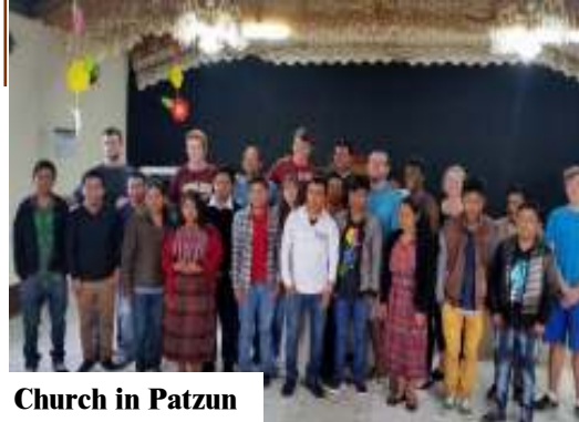
Church in Patzun