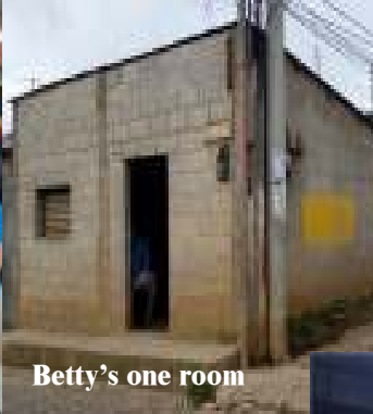
Betty's one room